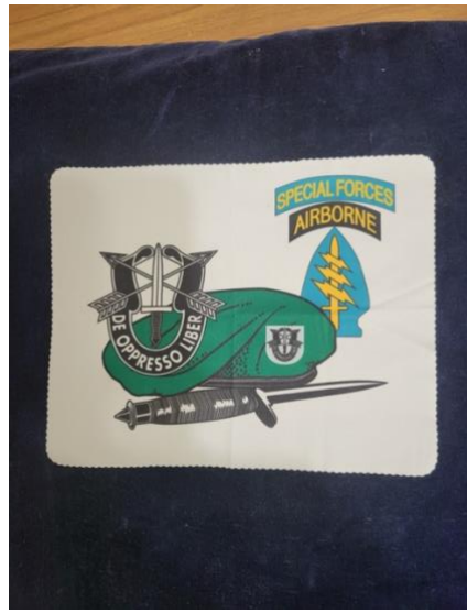
SF Eyeglasses Cleaning Cloth $7.00 plus $5.00 postage