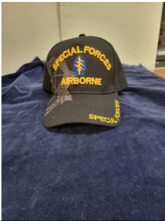
SF Hat $10.00 plus $8.00 postage