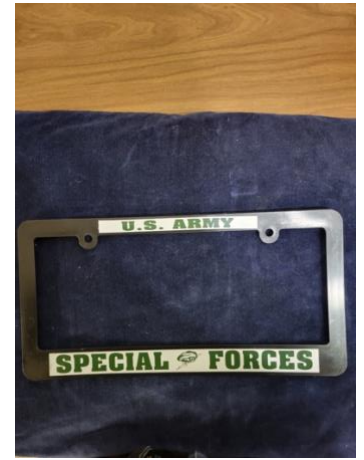
SF Black License Plate Frame $7.00 plus $6.00 postage