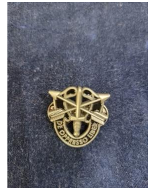
SF Crest Pin $7.00 plus $5.00 postage

Make checks payable to SFA Chapter 21 Mail checks to: Susan Micelli 4243 McCorvey Rd Deland, FL 32724