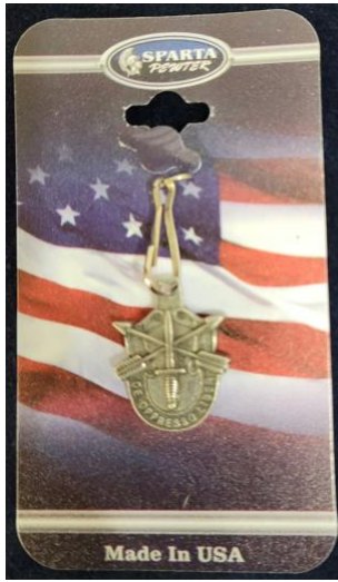
SF Zipper Pull $7.00 plus $5.00 postage

Some great items available through our Chapter XXI Quartermaster. This month's specials are: