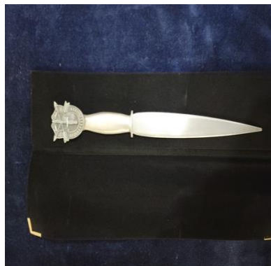
SF Letter Opener $20.00 plus $6.00 postage