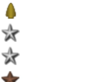
European–African–Middle Eastern Campaign Medal with Arrowhead device, two silver and one bronze campaign stars [96][99][106]