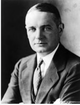
Donovan in 1924, during his time in the Department of Justice

Following his return to the U.S., Donovan took his wife on a combined vacation, business trip, and intelligence mission to Japan, China, and Korea, then went on alone to Siberia. [24] He went back to work at his law firm, but also took an extensive journey to Europe, where he did business on behalf of J. P. Morgan and gathered intelligence about international Communism. [25]