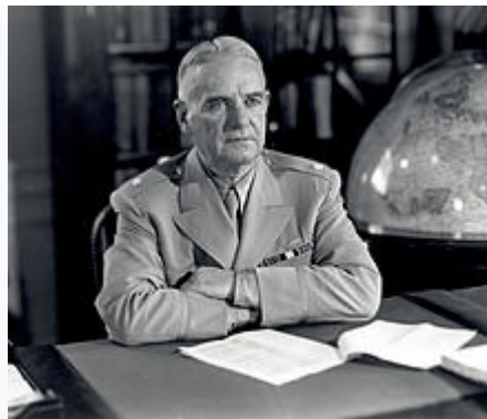
Donovan, Head of the OSS

In the closing days of the war in Europe, Donovan spent much of his time in London, where he worked out of a command center that took up an entire floor of Claridge's Hotel. He fielded reports from across the continent, where the Wehrmacht was in such chaos that he "knew their positions on the battlefield better than German generals did." In one of many initiatives, he sent out "teams of French, Danish, Norwegian, and Polish nationals" to identify Gestapo officers who had tortured them and who now were trying to blend in with civilians in Allied-controlled areas of Germany. Acting on Donovan's orders, Dulles oversaw the surrender of the remaining Nazi forces in Italy several days in advance of the final German capitulation. [71][72]