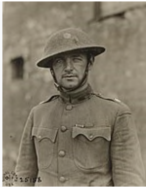
Donovan as a Lt. Colonel with the 165th Regiment in France in September 1918.

During World War I, Major Donovan led the 1st battalion, 165th Regiment of the 42nd Division. Serving in France, he suffered a shrapnel wound in one leg and was almost blinded by gas. After performing a rescue under fire, he was offered the Croix de Guerre, but turned it down because a Jewish soldier who had taken part in the rescue had not also been awarded the honor. When this insult was corrected, Donovan accepted the distinction. [16] He also was awarded the Distinguished Service Cross for leading an assault during the Aisne-Marne campaign, in which hundreds of members of his regiment died, including his acting adjutant, the poet Joyce Kilmer. [17] The events of this battle and the 69th Infantry Regiment's role in it were dramatised in the James Cagney movie, "The Fighting 69th".